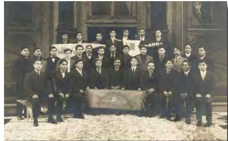
Image of founders and early members of ANB at a November 1914 gathering, PO-023, Item 2.

With the right to vote, the _____ and the _____