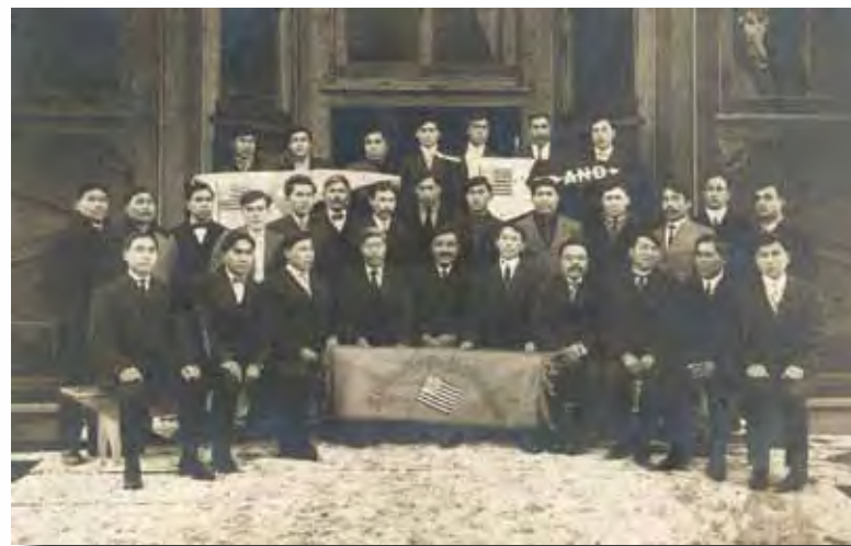
Image of founders and early members of ANB at a November 1914 gathering, PO-023, Item 2.

With the right to vote, the Alaska Native Brotherhood and the Alaska