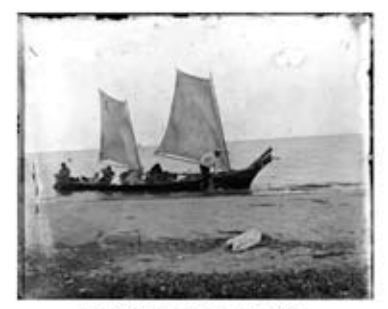
Dugout cance with two sails, co. 1900