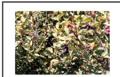
Naa naa kanat'aayí